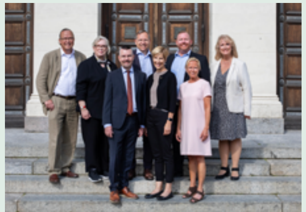
The Lund University Management Team

"A world-class university that works to understand, explain and improve our world and the human condition."