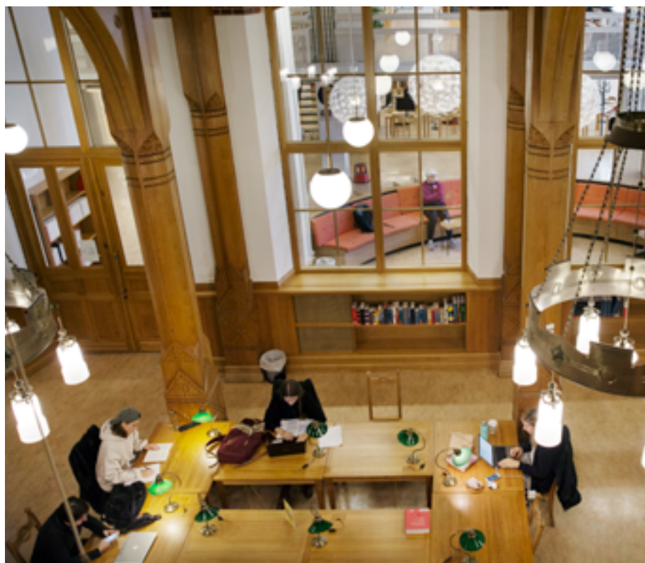
Lund University has a network of 24 libraries with more than 2.8 million printed books and an electronic library collection including 700 000 e-books, 50 000 e-journals and more than 200 databases.

Methods of instruction can vary greatly. Lectures with groups of 25–30 students are a common form of instruction. But there may also be larger lectures, group work, labs and seminars. Studies are usually undertaken one course at a time, with an examination or essay at the end of each individual course. For some programmes, for example in economics and engineering, it is common to have two or more courses in parallel. Courses can be anything from 2–20 weeks long (with 5, 10 and 20 weeks being the most common). Some courses, mainly in engineering, have as many as 30 formal lecture hours per week as well as laboratory work, while others, for example in the social sciences, may only have 10 hours in class, and rely more on the students' individual reading. A total of 30 ECTS credits per semester is considered to be full-time studies.